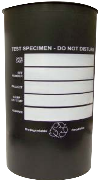
6"x12" Test Specimen Custom imprinting available (Shown with optional Imprinted Generic Label)