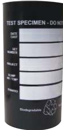
4"x 8" Test Specimen (Shown with optional Imprinted Generic Label)